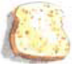
1 slice of whole-grain bread