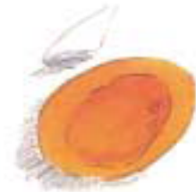
plate and napkin