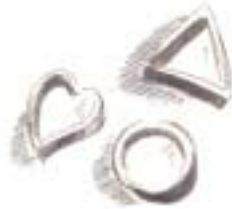
cookie cutters in different shapes